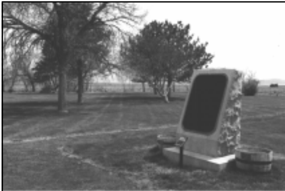
This monument at the site of Camp Floyd states that President James Buchanan assembled the largest troop concentration in the history of the United States prior to the Civil War.

Saints had been hounded from New York to Ohio to Missouri to Illinois and finally to Utah. They had been thrown out of each of those places by the local citizenry because of their beliefs and practices. There is plenty of blame to go around—both for the Mormons and for the Gentiles. Suffice it to say that Mormons felt they were strangers in America. Do not overlook, however, that Mormonism was not requesting to practice its faith quietly at home. No, it was out to change the world and to bring all civil authority under the