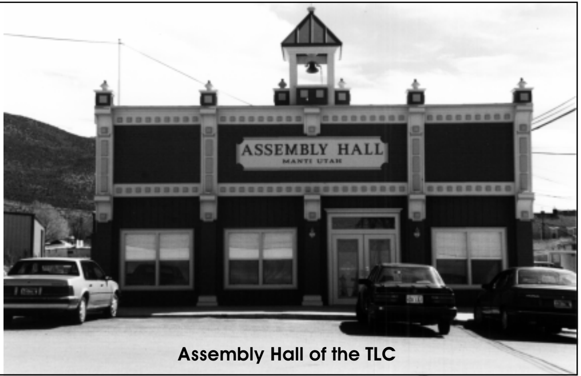
Assembly Hall of the TLC

It was a smart move on their part. We met on a Sunday night and Christians from six churches gathered together for a standing-room-only meeting. We had, I believe, about 300 people present. To a man, the pastors said the meeting was one of the best things they had done together for the community. Now that they had their people on board, they decided we could