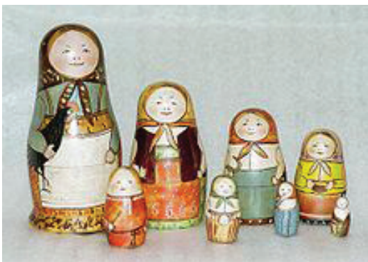
Matryoshka dolls, also known as Russian nested dolls or a babushka dolls, are sets of dolls of decreasing size placed one inside the other.

But what is even more incredible, is that we are asked to believe that the story reinvents itself three different times. A nearly identical story happens in the Book of Mormon to three entirely different groups