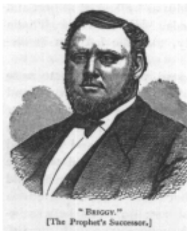
"BRIGGY." [The Prophet's Successor.]

out the assistance of the tithing-office and other church perquisites; but he is infinitely better-hearted, kindlier in impulse, and is the most popular of them, although that is not according him a very high place in public estimation. He has been "on a mission," and had his "little fling" before he settled down to the dignity of his present position.