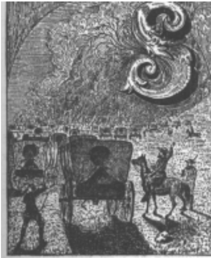
MORMONS BURNING A GOVERNMENT TRAIN.

We had intended to go by ourselves; but one of the young wives, who was very attached to my mother, begged to be allowed to go. She appealed first to my father, and he, in turn, referred her to my mother.