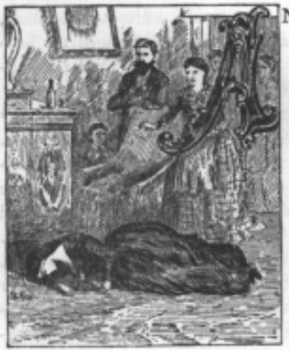
ONLY A WIFE OUT OF THE WAY.

A NOTHER immediate effect of the “Reformation” was to increase the practice of polygamy. To alter an old rhyme to suit the occasion,