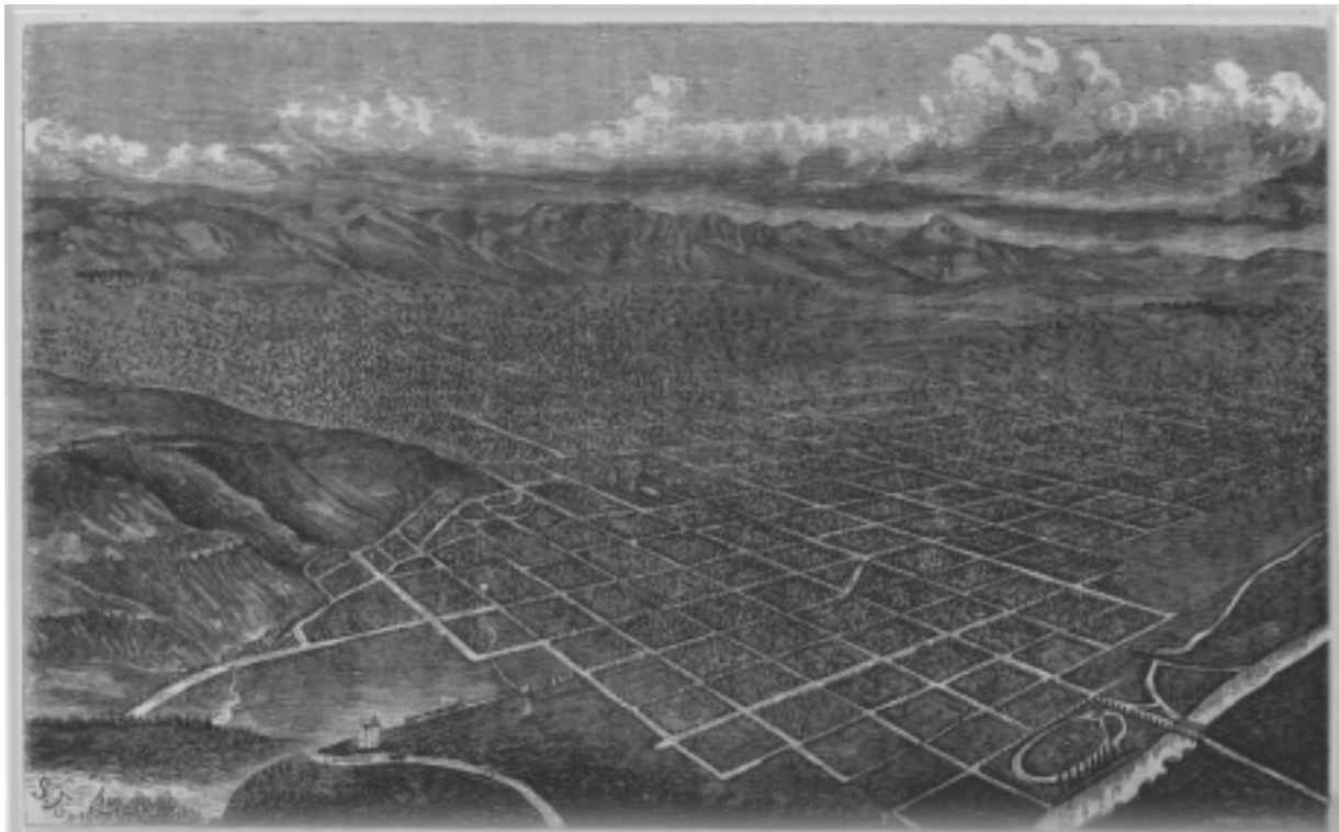
BIRD'S-EYE VIEW OF SALT LAKE CITY