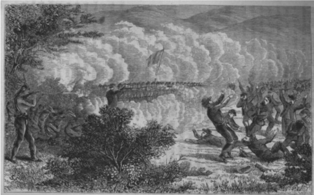
THE MOUNTAIN MEADOWS MASSACRE.—MURDERED BY SUPPOSED FRIENDS.