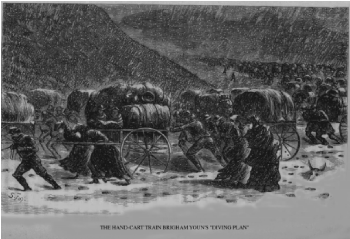
THE HAND-CART TRAIN BRIGHAM YOUN'S "DIVING PLAN"