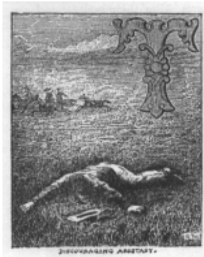
161 HOW APOSTATES WERE “KILLED BY THE INDIANS!”

I can remember listening in round-eyed wonder and terror at recitals of Indian atrocities, for we were surrounded